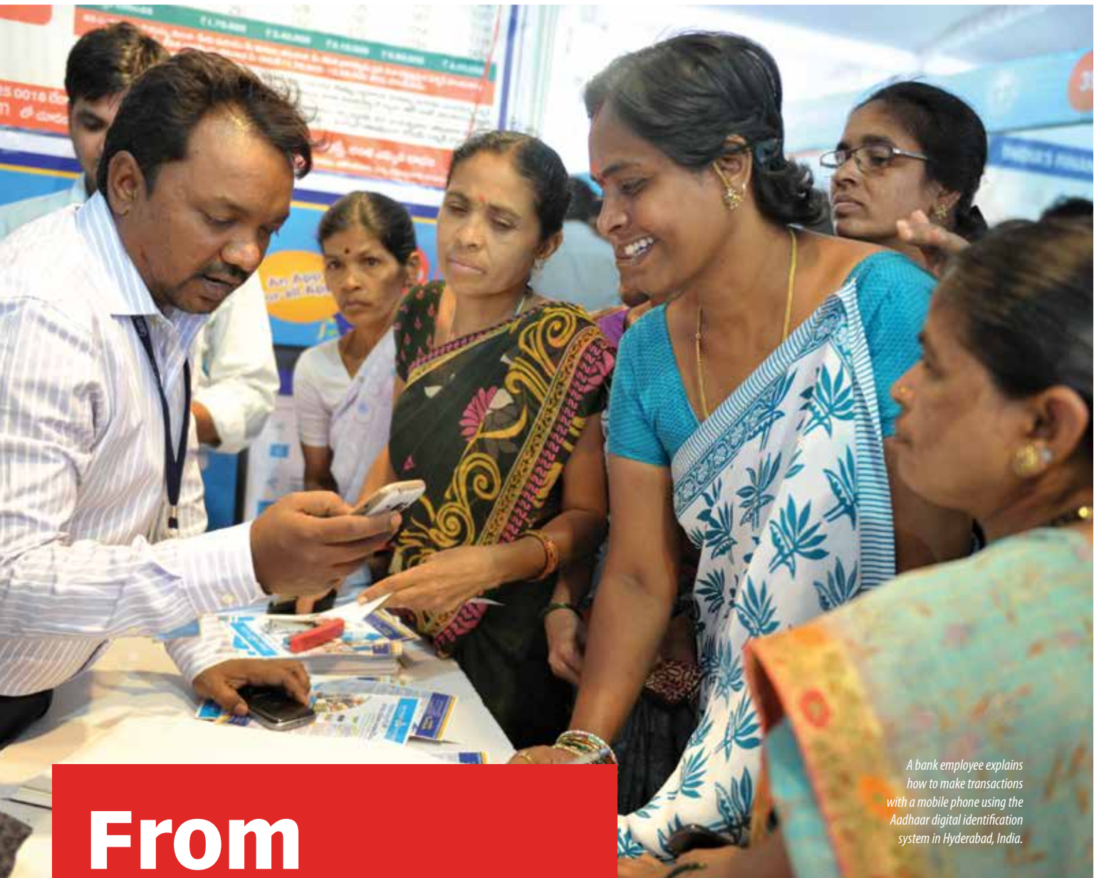
A bank employee explains how to make transactions with a mobile phone using the Aadhaar digital identification system in Hyderabad, India.